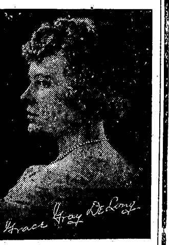
Unhappy, undecided, in doubt, worried, not well? Business, domestic, social, love affairs wrong? Write freely, frankly and confidentially—request information and advice pertaining this beloved woman's work and methods. You can win. Do it now. Address: