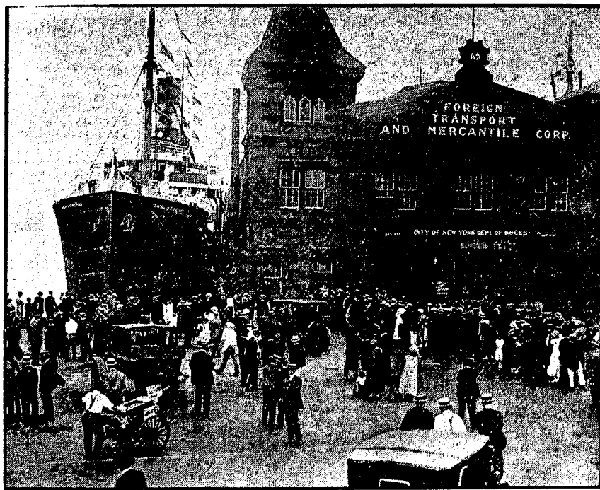
SCENE AT PIER 65, NEW YORK, LAST SUNDAY AFTERNOON, WHERE S. S. GENERAL GOETHALS, SEEN IN PICTURE, WAS MOORED.

"The Universal Negro Improvement Association is determined to do all in its power to assist in bringing about a solution of the Negro problem in the United States as well as elsewhere. We believe that the most feasible solution is the repatriation of the Negro to his original homeland, Africa. For that reason we are organizing the settlement of the Negroes of America toward this end. Already we have seven million people, members of the race, who have actively identified themselves with our organization. Through these people we are now taking practical steps toward the race's repatriation. We believe that we must have ships and it is for that reason that we have secured the 'General Goethals.' We intend to have this ship sail during the fall with the first contingent of emigrants for Africa. As fast as we acquire capital we will invest in more ships until we have succeeded in establishing a regular route between America and Africa, conveying to the latter place those Negroes who