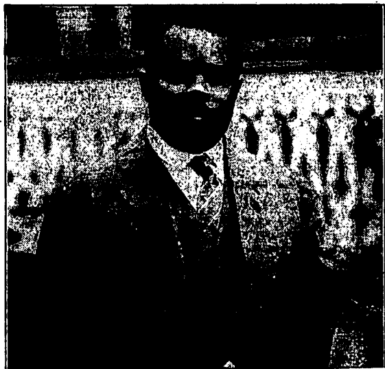
The Chieftain As He Is Today

Organization Founded By Marcus Garvey Not A Infidel Association—Realizes God Made Men Masters Of Their Fate, Architects Of Own Destinies—Reserves The Right To Worship In Our Own Way—Demand Our Portion In The World