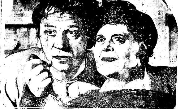
Famous Stars of "Min and Bill" Again Score in Human, Laugh-and-Tear Drama

Thrills, laughs and heart throbs all mingle in the reunion of Marie Dressler and Wallace Berry, who are again co-starred in "Tugboat Annie," which is a sea-going tug and completes a series of pictures which have been most successful in the actual history of the Norman Petty boat Annie. In "Tugboat Annie," which is a sea-going tug and completes a series of pictures which have been most successful in the actual history of the Norman Petty boat Annie.